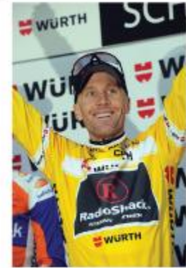
Olympian and Grand Tour Cycling Legend