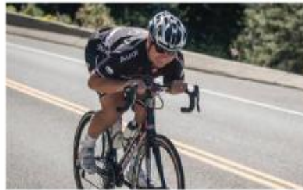
Olympian and 6x Consecutive World Speed Skiing Champion