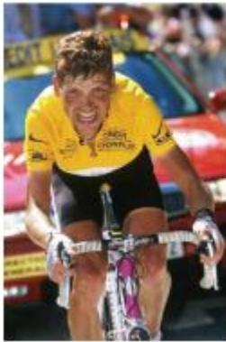
Tour de France, Olympic and World Champion Cycling Legend